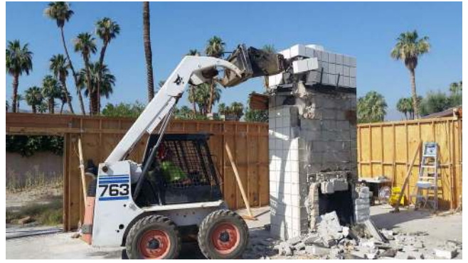
Recent Projects: Recent Projects