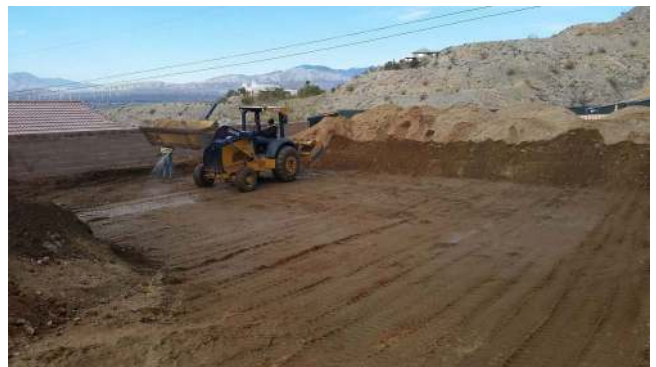
Recent Projects: Recent Projects