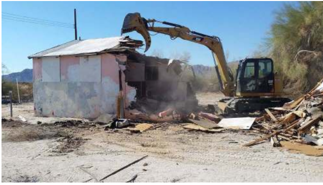
Recent Projects: Recent Projects