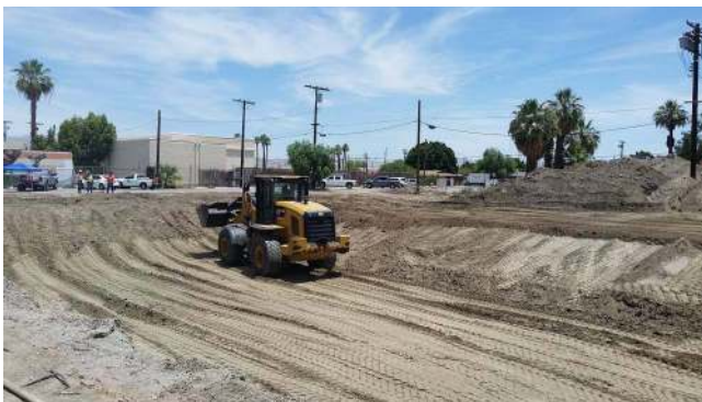
Recent Projects: Recent Projects